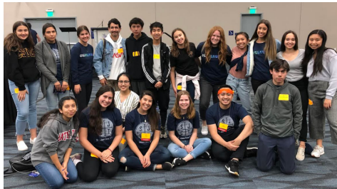
This group of High School Youth Ministry students attended the Religious Education Congress Youth Day.

Register for Steubenville (see info below)